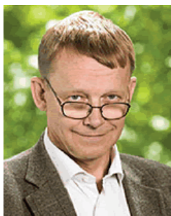
Dr. Hans Rosling • SWEDEN Saturday, February 14, 2009 11:00–11:45