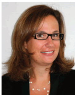
Dr. Ilaria Capua • ITALY Friday, February 13, 2009 16:30–17:15